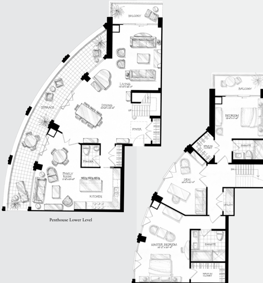
Penthouse Lower Level